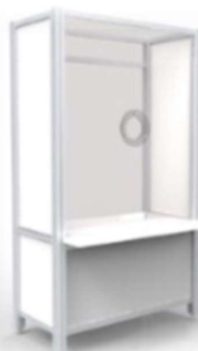
HCAB244879LN Booth 48" Wide