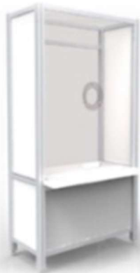
HCAB244279LN Booth 42" Wide