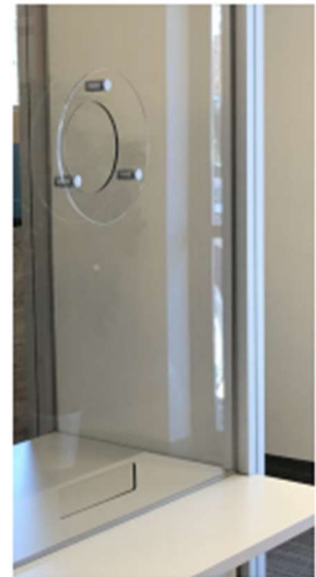
Speak-Thru and Document Access