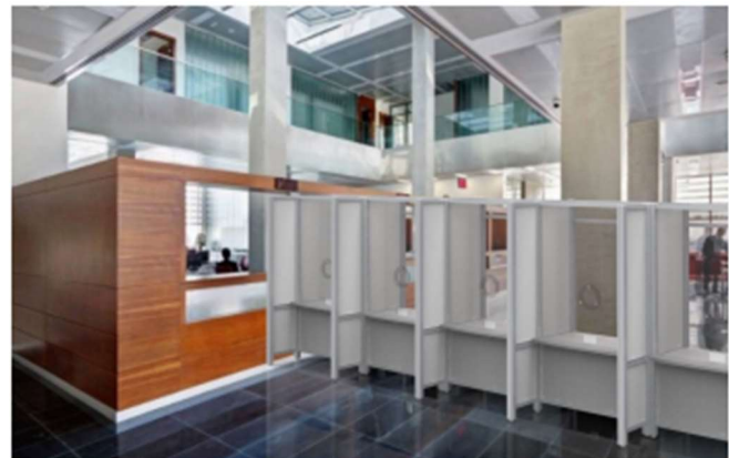
Connected Booths in a Public Area