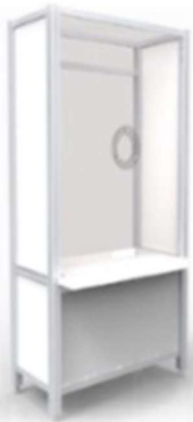
HCAB243679LN Booth 36" Wide